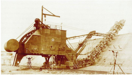
Since 1725 TAKRAF has built up a wealth of experience which is outstanding in the world of the global mining and material handling industry.

No matter what you need - TAKRAF is your reliable and innovative industry specialist for mining, bulk handling, minerals processing, air environmental, technical studies and after-sales support.