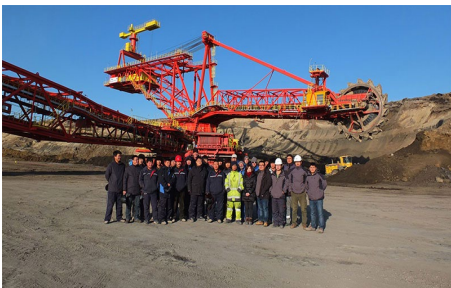
Zhahanaoer open pit mine in Inner Mongolia, China.