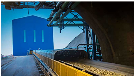
Codelco's Chuquicamata Underground Project in Chile