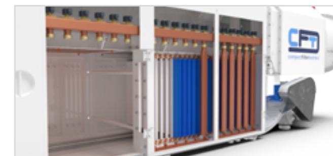
CFD with discharge scraper chain conveyor