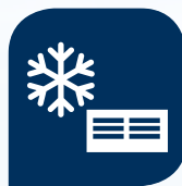
Air cooling systems