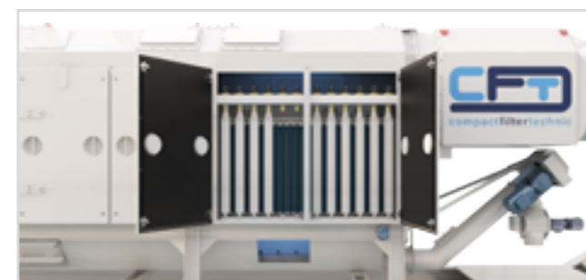
CFD with dust collection hopper and discharge screw conveyor