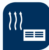
Air heating systems